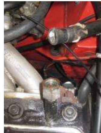
Now you don't

Second step – screw in the new valve with plenty of PTFE tape on the thread and attach cable:-