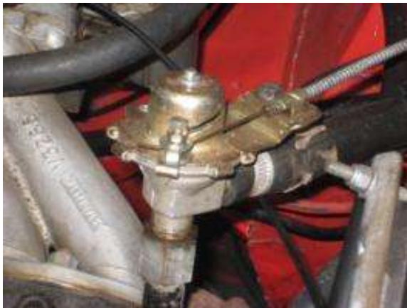
Now you see it