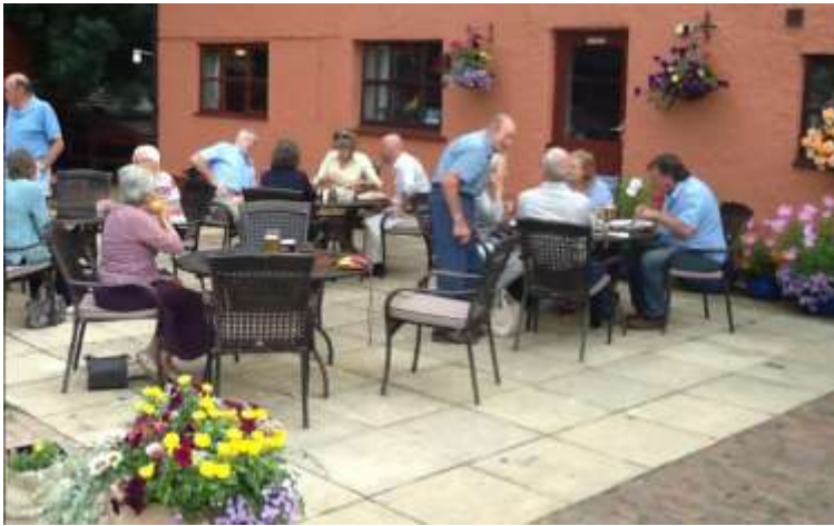
Gathering of the clans