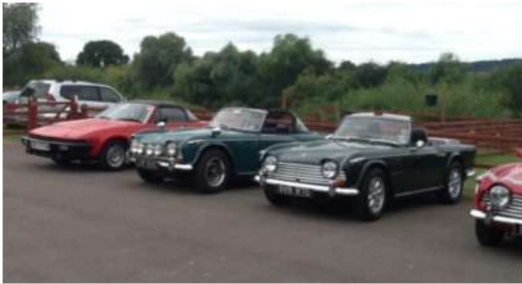
Cars lined up for inspection