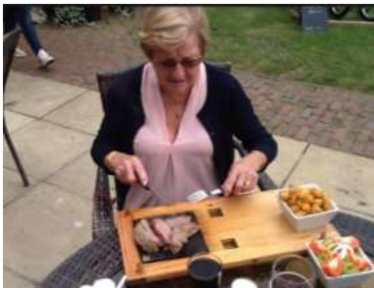
Meg tucking into the house speciality