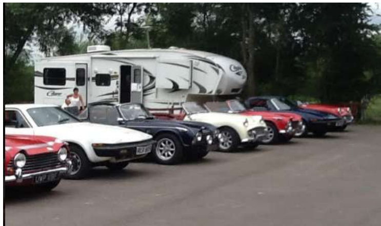
No – Rob’s car is not pulling the trailer!