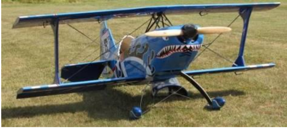
“PITBULL” (and Pilot!)