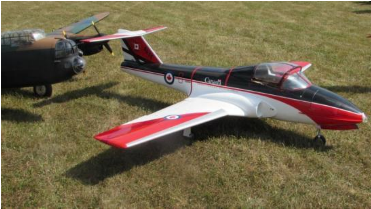
The Lancaster was wonderful to see and hear in the air , flying at scale speed with synchronised engines...