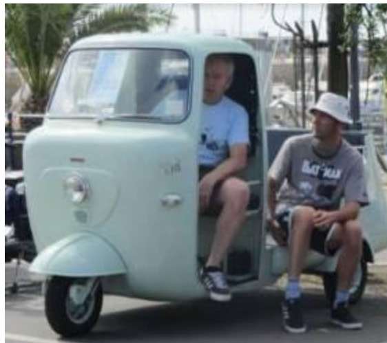
a Lambretta commercial and