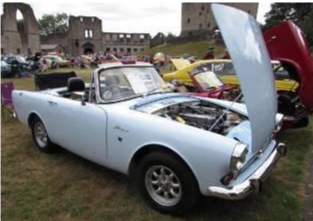
An immaculate Sunbeam Alpine with a hot engine..

From the heading picture you can see the variety of cars on display, but a few that caught my attention were: