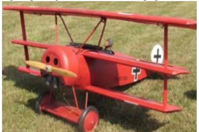
.... But in my opinion, and I am sure that of most other spectators, the display of the day was put on by ....