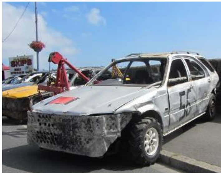
what once was a Jaguar X type estate which has been sand racing- get those tyres.