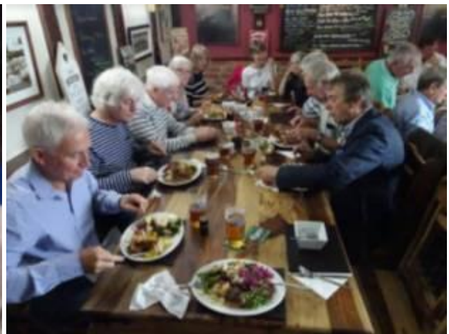
Coal House Sunday Lunch