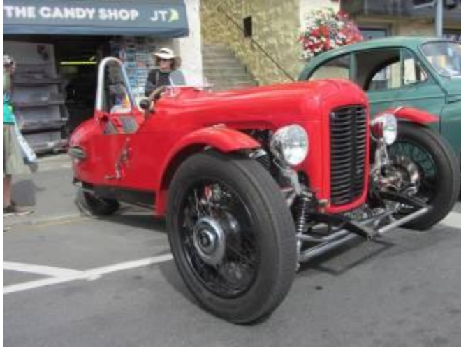
a Massey Ferguson 35 that has lost a wheel and gained a huge Vee Twin engine,

We returned a couple of weeks ago from a visit to the Channel Islands to watch the hill climbs at Bouley Bay (Jersey) and Val des Terres (Guernsey). While full rounds of the British Hill Climb Championship with RAC stewarding, the occasions were so relaxed. No charge to watch, programmes free (though you could make a donation), open access to the paddock and very few "Do Not" signs. Yet the whole thing was very efficiently run. Three interesting vehicles seen in the car parks: