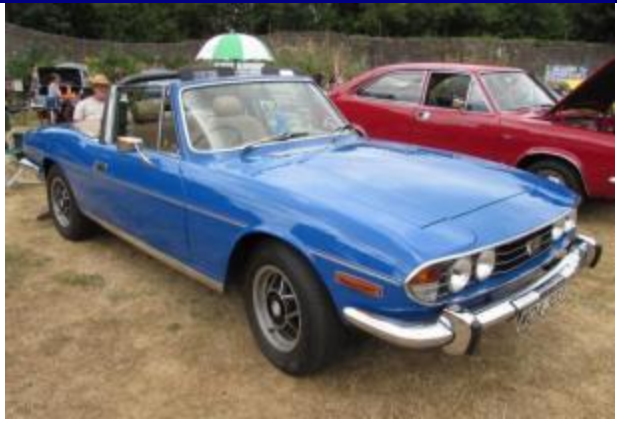
A Vitesse and a Herald...