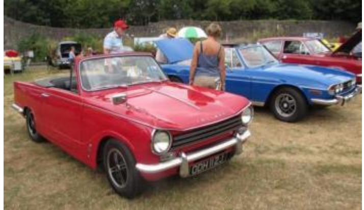
And a Spitfire..