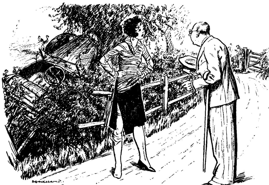
KINDLY PEDESTRIAN. “My dear young lady, have you met with an accident?” OWNER DRIVER. “Well, I ask you—do you think I always look like this?”